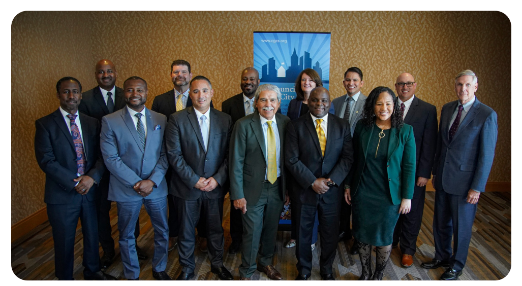
The first graduating cohort, pictured at the 67th Annual Fall Conference in San Diego.