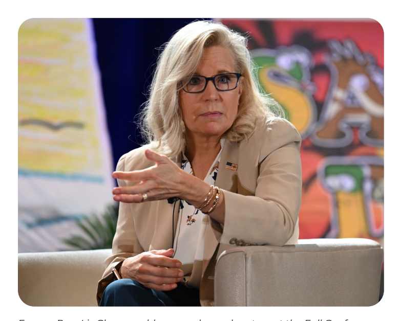
Former Rep. Liz Cheney addresses urban educators at the Fall Conference in San Diego.