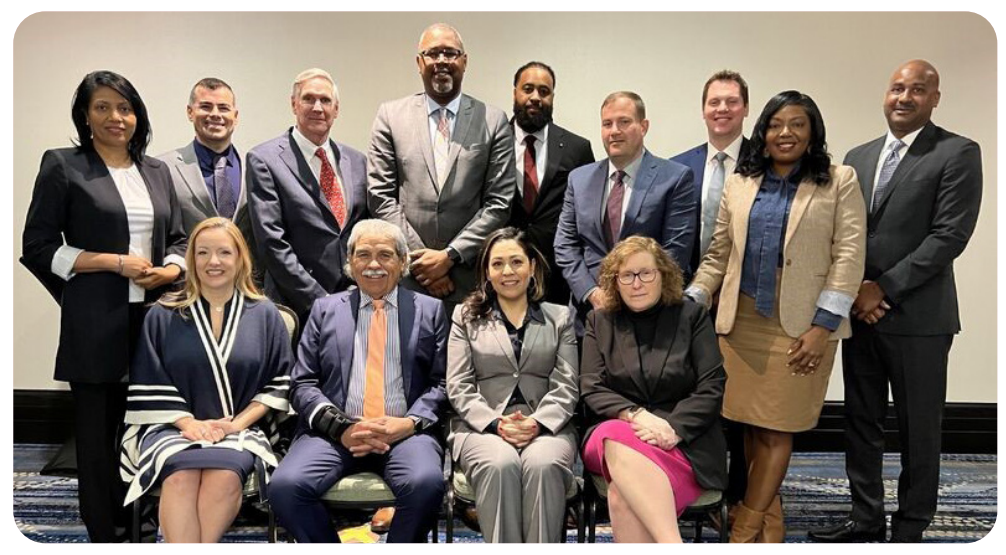
Cohort 2, with Council faculty members, pictured at their initial meeting in February.